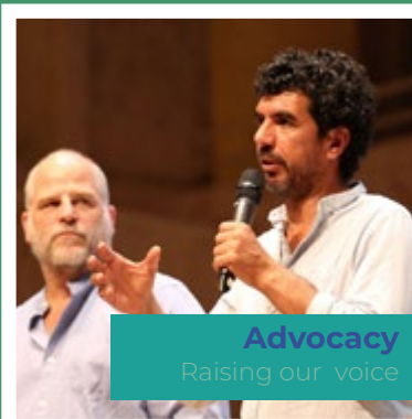
Advocacy Raising our voice