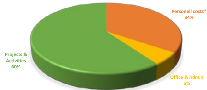
EXPENSES 2018 (501.000 USD)

* Salaries for professionals in Management, Administration, Media, Project Coordination)