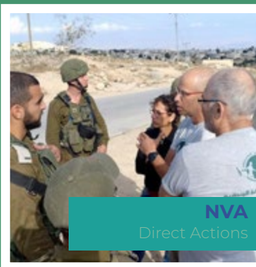
NVA Direct Actions