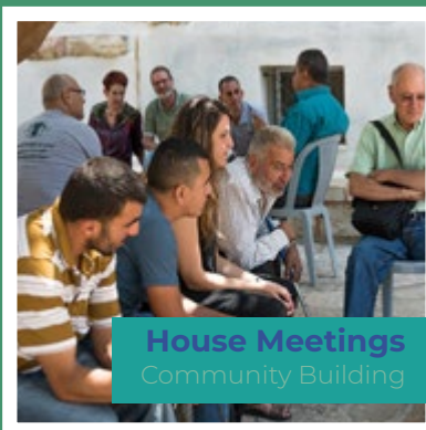
House Meetings Community Building

In 2018 we continued to strengthen our key activities in EDUCATION, ACTION and INFLUENCE. The heart of the movement is our house meetings. We regularly meet with large numbers of Israelis, Palestinians and internationals, introducing them to the narratives on both sides. Our main programs target Israeli teens before they join the army, interested Palestinian communities, the general Israeli public and political or international delegations. We use our personal stories and the stories of personal transformation to show everyone, that change – both personally and politically – is possible. Once convinced, we ACT – meaning we work to bring people to the street in nonviolent resistance. We rebuild demolished homes and structures; help Palestinians harvest their crops when faced with settler or military violence, protect shepherds in the Jordan Valley who are faced with systemic violence, build rain water catchment systems for those denied access to running water, and protest injustice and inequality, such as street closures in the West Bank. At the same time we have begun to implement additional national and international campaigning and lobbying.