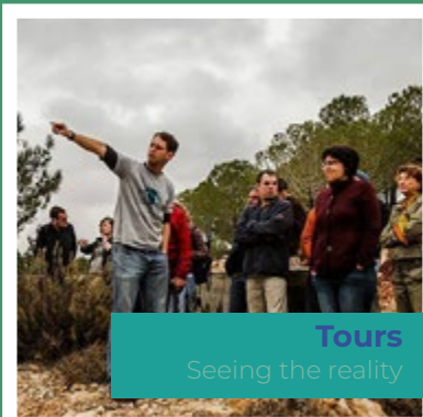
Tours Seeing the reality